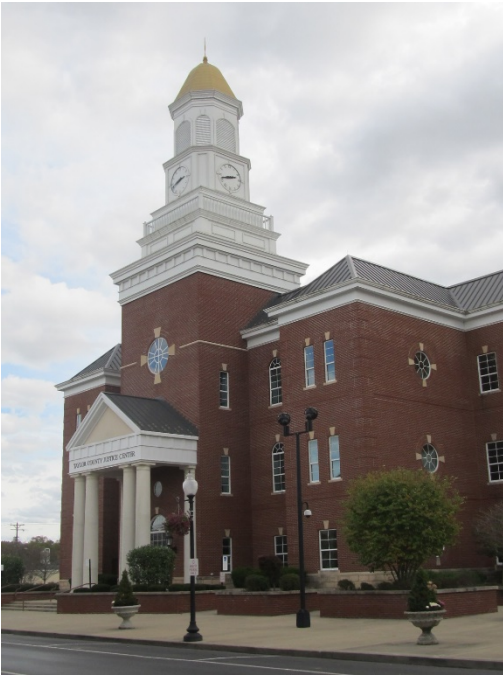
Caption: TAC-407 Justice Center