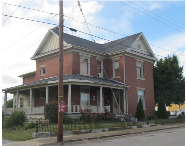
Caption: TAC-436 Halfway House