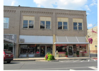
TAC21_02 Huddelston Properties LLC 247 Burdick School Road Campbellsville, KY 42718