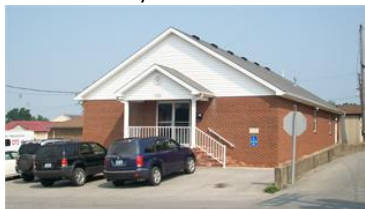
PHOTO B (Place Additional Photos below under 26. continued)

25. COMMENTS/HISTORICAL INFORMATION (Complete on Continuation Sheet)