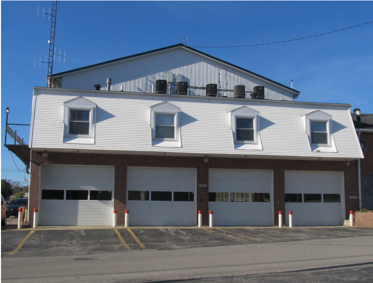
Caption: TAC383_03 Rear of Fire Department