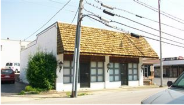
Caption: TAC386_03 The front façade faces south and has two entry doors and a wood shingle shed roof overhang to shield pedestrian from the elements.