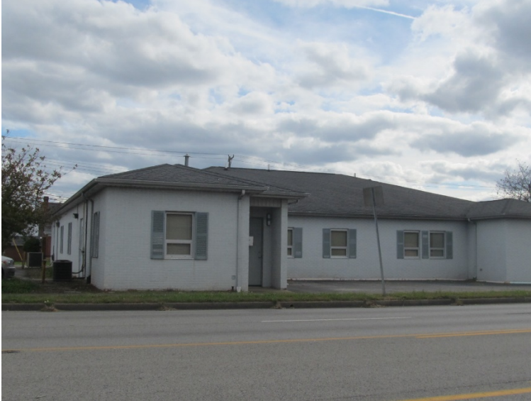
Caption: TAC392_03 The north (side) of the building.