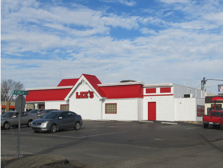
Caption: TAC393_03 The west (side) of the building.