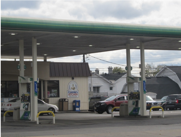
Caption: TAC394_03 The north (front) of the building with gas pumps in front facing Broadway.