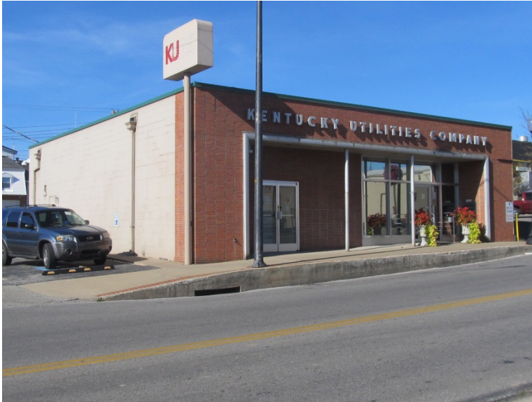
Caption: TAC398_03 Front (south) and side (west) elevations.