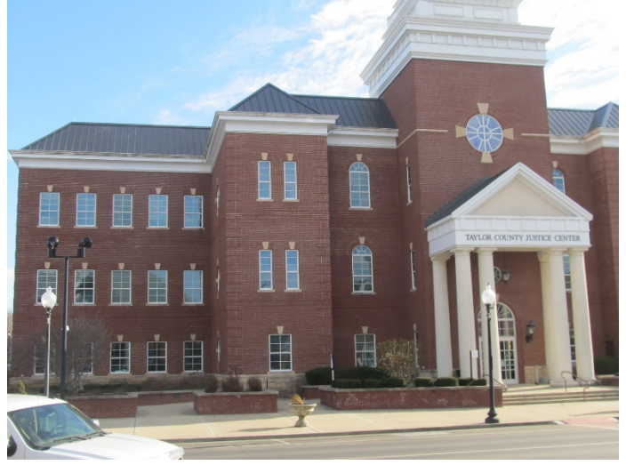
Caption: TAC407_03 A partial view of the north (front) of the building with cupola above main entry doors facing E. Main Street.