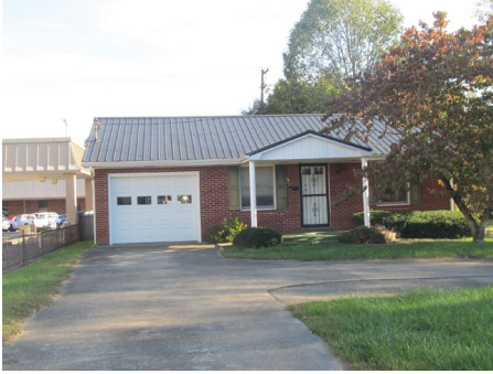
Caption: TAC409_03 A view of the north (front) of the residence facing E. Main Street.