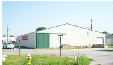
PHOTO B (Place Additional Photos below under 26. continued)

25. COMMENTS/HISTORICAL INFORMATION (Complete on Continuation Sheet)