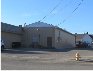
Caption: TAC413_01 The south (rear) façade of the building.