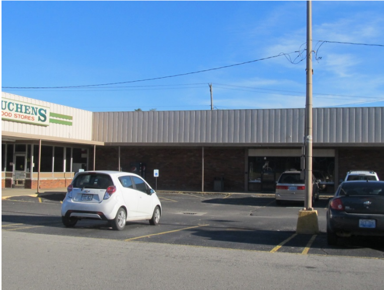
Caption: TAC415_03 Partial West (front) elevation.