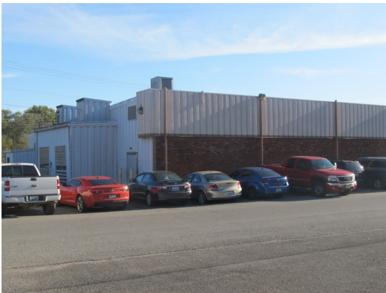
Caption: TAC415_04 Partial East (rear) and North (side) elevations.