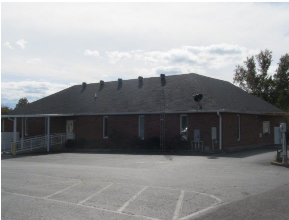
Caption: TAC433_04 East (rear) façade.