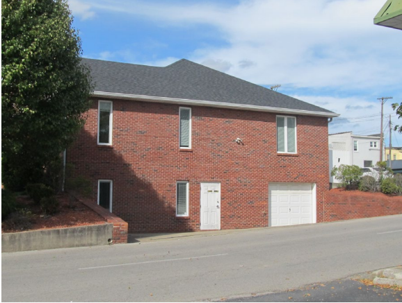
Caption: TAC433_03 Side (south) façade.